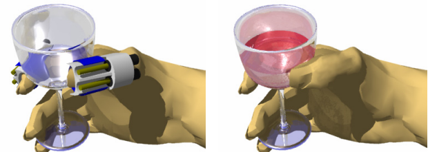
Figure 1: Conceptual representation of our proposed device. By wearing our proposed devices on the index finger and the thumb, the user can feel the augmented weight and inertia of the water that is virtually filled in the actually empty glass.

We implemented the prototype device shown in Figure 3 and then confirmed the recognition ability of the weight sensation presented on the user's finger by this method. By wearing our proposed devices on the index finger and the thumb, the user can perceive the grip force and the mass of a virtual object. The grip force, gravity, and inertia mass of a virtual object are presented on the user's fingerpads during shaking and rotational motion.