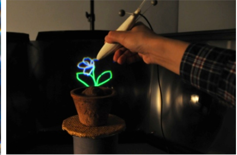
Figure 3: Drawing 3DCG (Flower) on the Real Object (Pot)