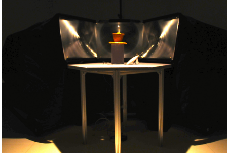
Figure 1: System Appearance